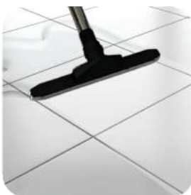
Wet Pick Up