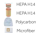
4 Stage Filtration