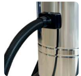
Stainless steel tank for impact and corrosion resistant