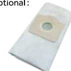
Microfiber Bag (10pcs/pack) 210-127-4