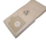
HVB10 (210-010) Double Layer Paper Bag (10pcs/pack)