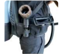
Dual Side pocket to keep accessories handy