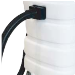
Semi Transparent PP Tank