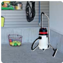
Space Saving & Practical Storage