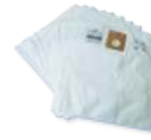
HVB-H (210-019) HEPA Pro-Filter Bag