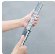
Adjustable Telescopic Wand up to 98cm