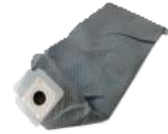
(210-310) Cloth Filter Bag Washable