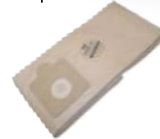
HVB10 (210-010) Double Layer Paper Bag (10pcs/pack)