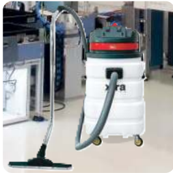
Industrial Wet & Dry Vacuum