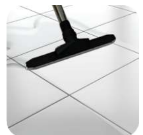
Wet Pick Up