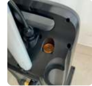
Indicator that warns if the dust bag is full or blocked