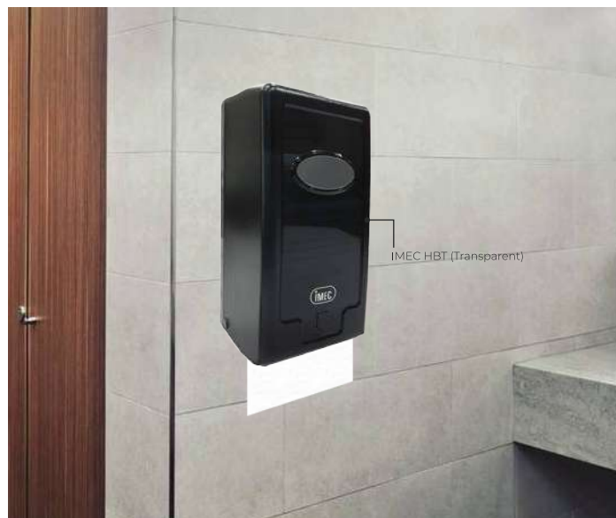
IMEC HBT (Transparent)