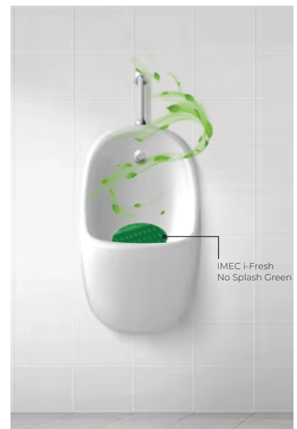
IMEC i-Fresh No Splash Green